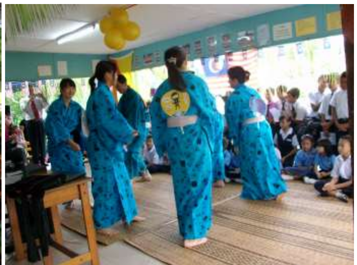
Raising seedlings at local schools (left) Cultural exchange program (right)