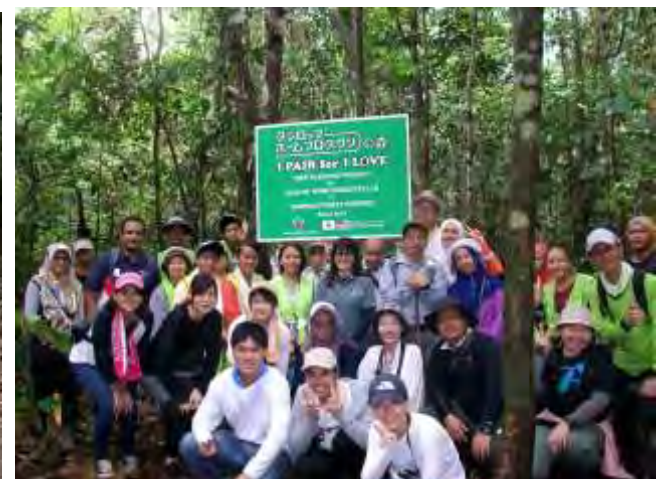
Tree planting program in 2010 (left) 10 th anniversary tree planting (right)