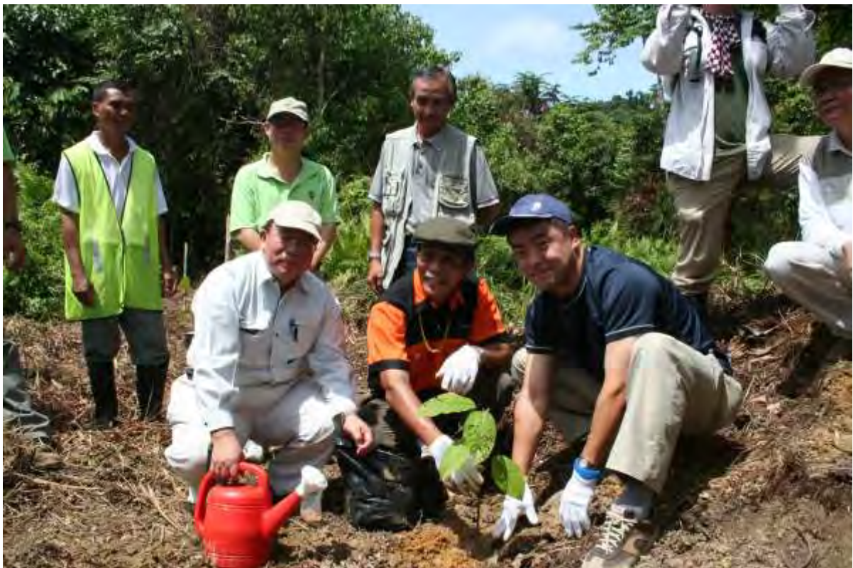
Tree Planting Ceremony at Gunung Apeng F.R. in November 2008