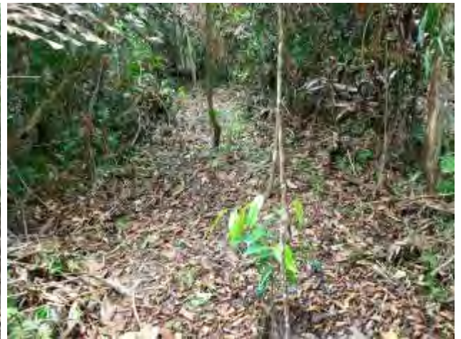
Line planting method in the secondary forests