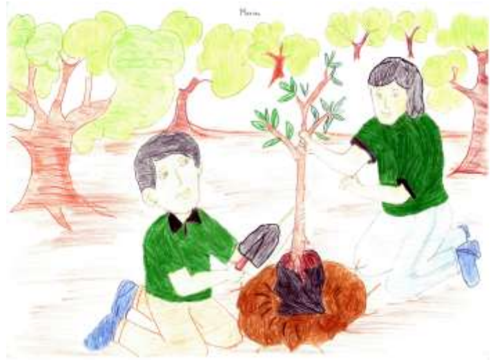
Educational program for youth at Gunung Apeng N.P. in March 2019