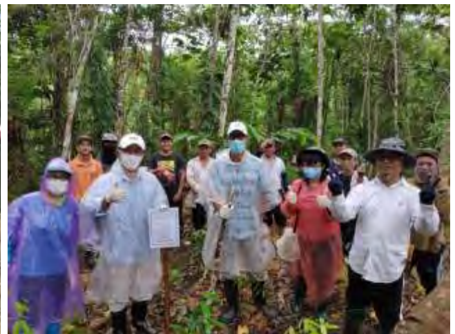
Tree planting program in 2008 (left) Observation visit by KL branch in 2022 (right)