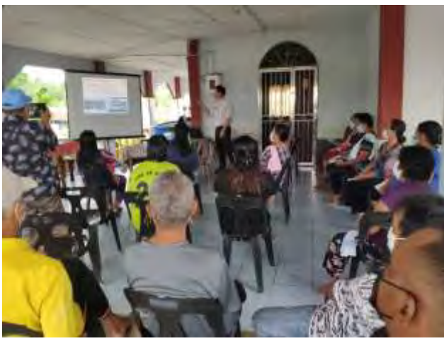
Dialogue session with villagers