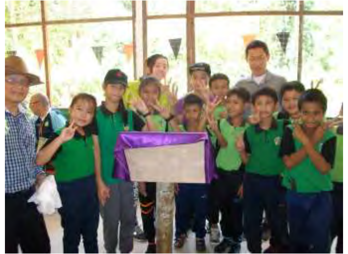
Group company staff regularly visit the tree planting site (left) Plant trees with school children(right)