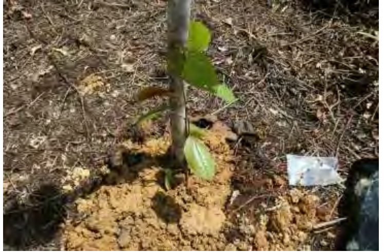
Plant indigenous species such as Dyobalanops beccarii and Shorea macrophylla