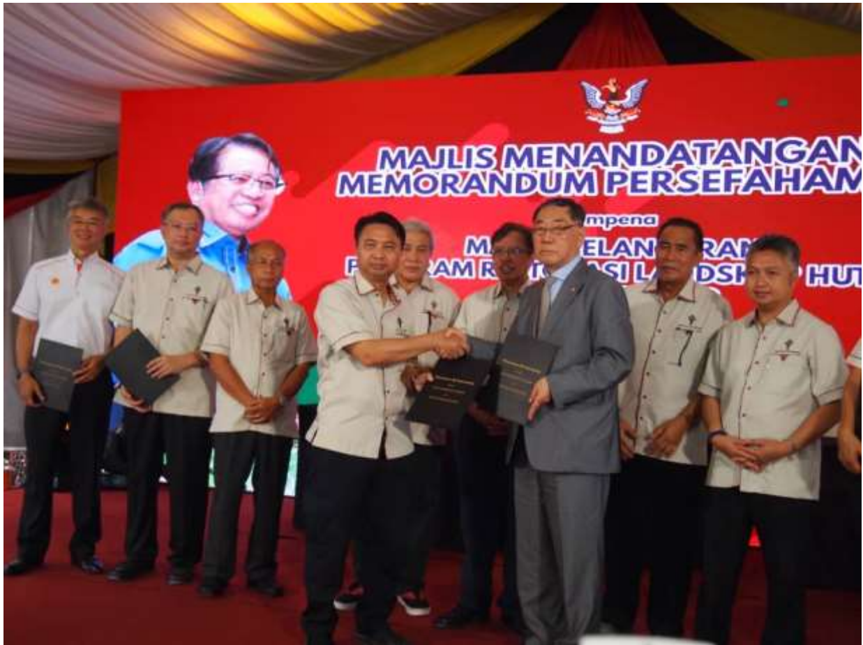
FLR Program MoU signing ceremony at Sabal F.R. in June 2019