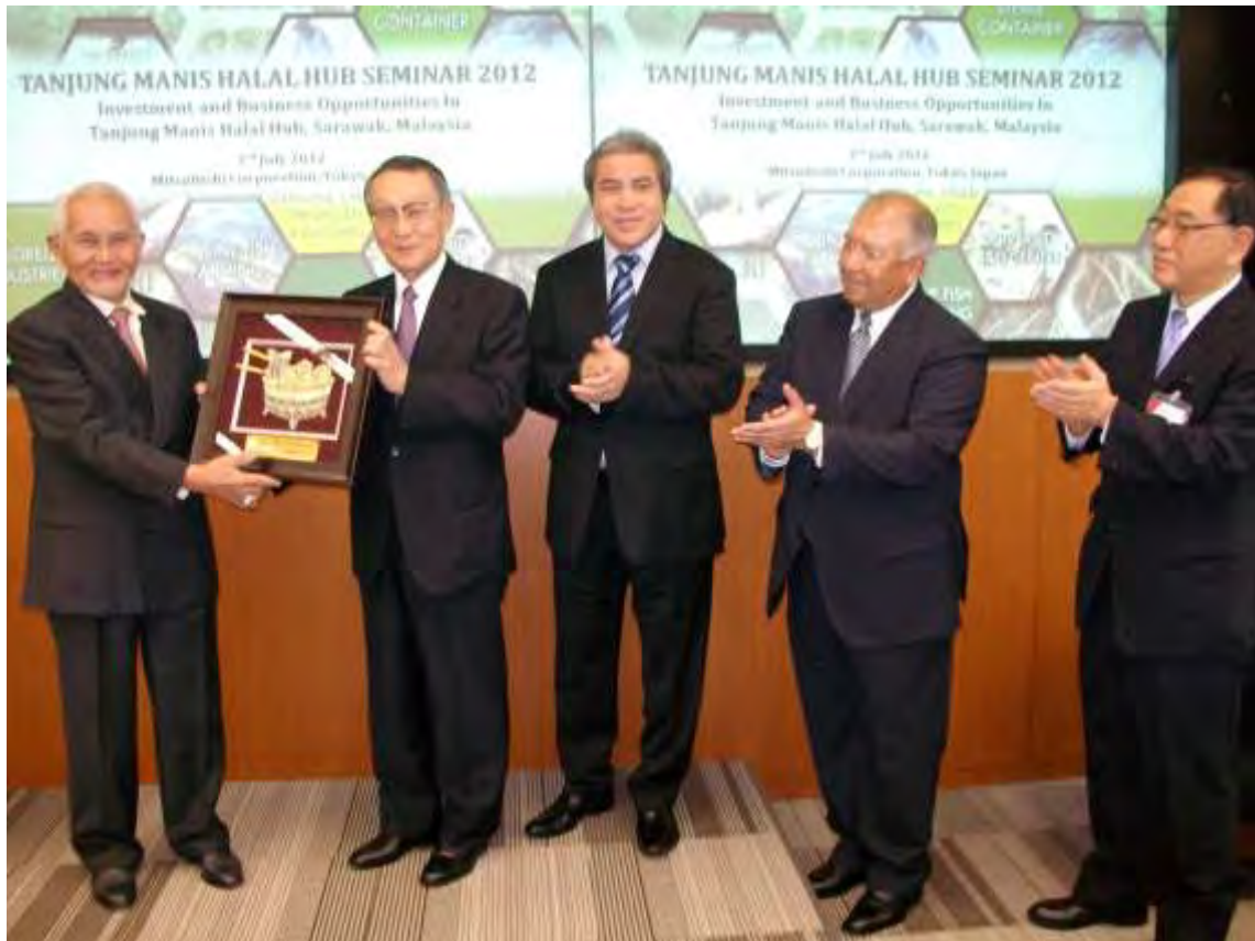
Sarawak Halal Hub Seminar in Tokyo in 2012 Co-organized by Sarawak State Government and Mitsubishi Corporation supported by JMA