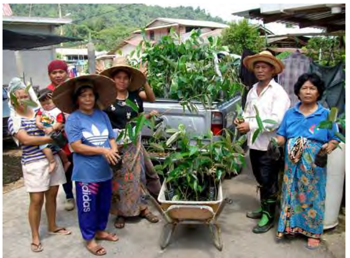
Fruit tree seedling raising workshop for village ladies by experts (left) We purchase seedlings for planting (right)