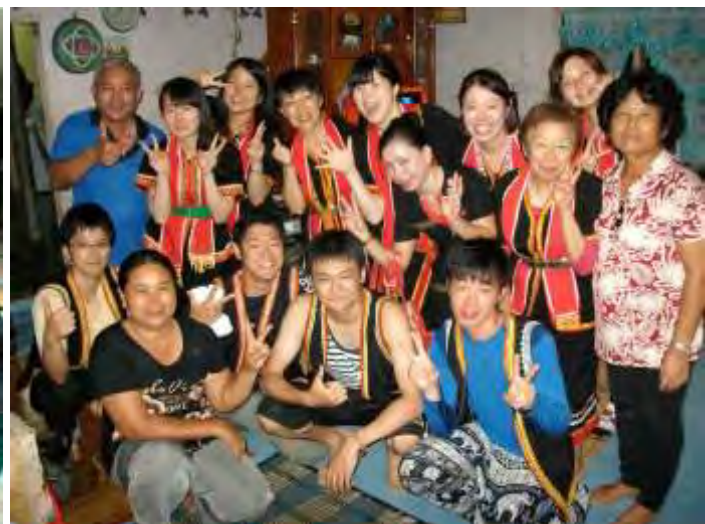
Students exchange at UNIMAS (left) Village stay experience for Japanese students (right)