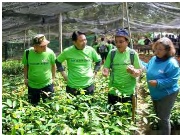
Director of Forest visited Gunung Apeng N.P. in March 2019