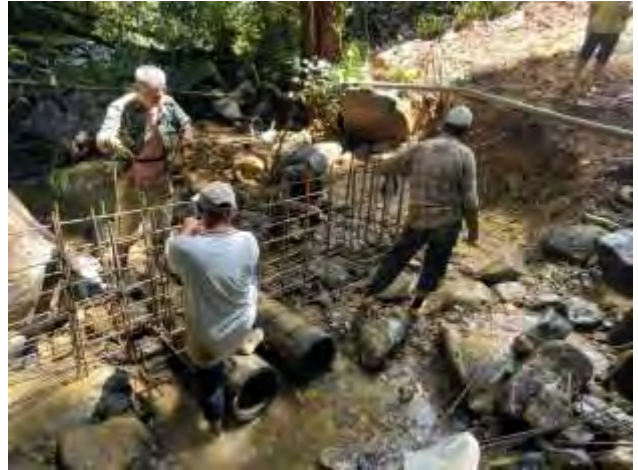
Transport materials for construction and small dam construction at water catchment area