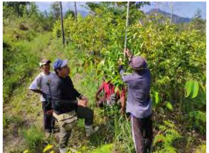
Dense and mixed planting method (Miyawaki method) at severely degraded area