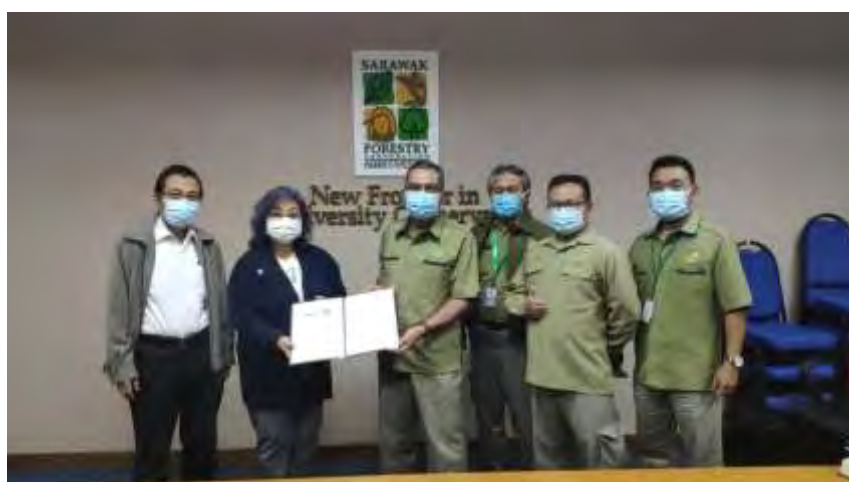
MoU signing with SFC in November 2020