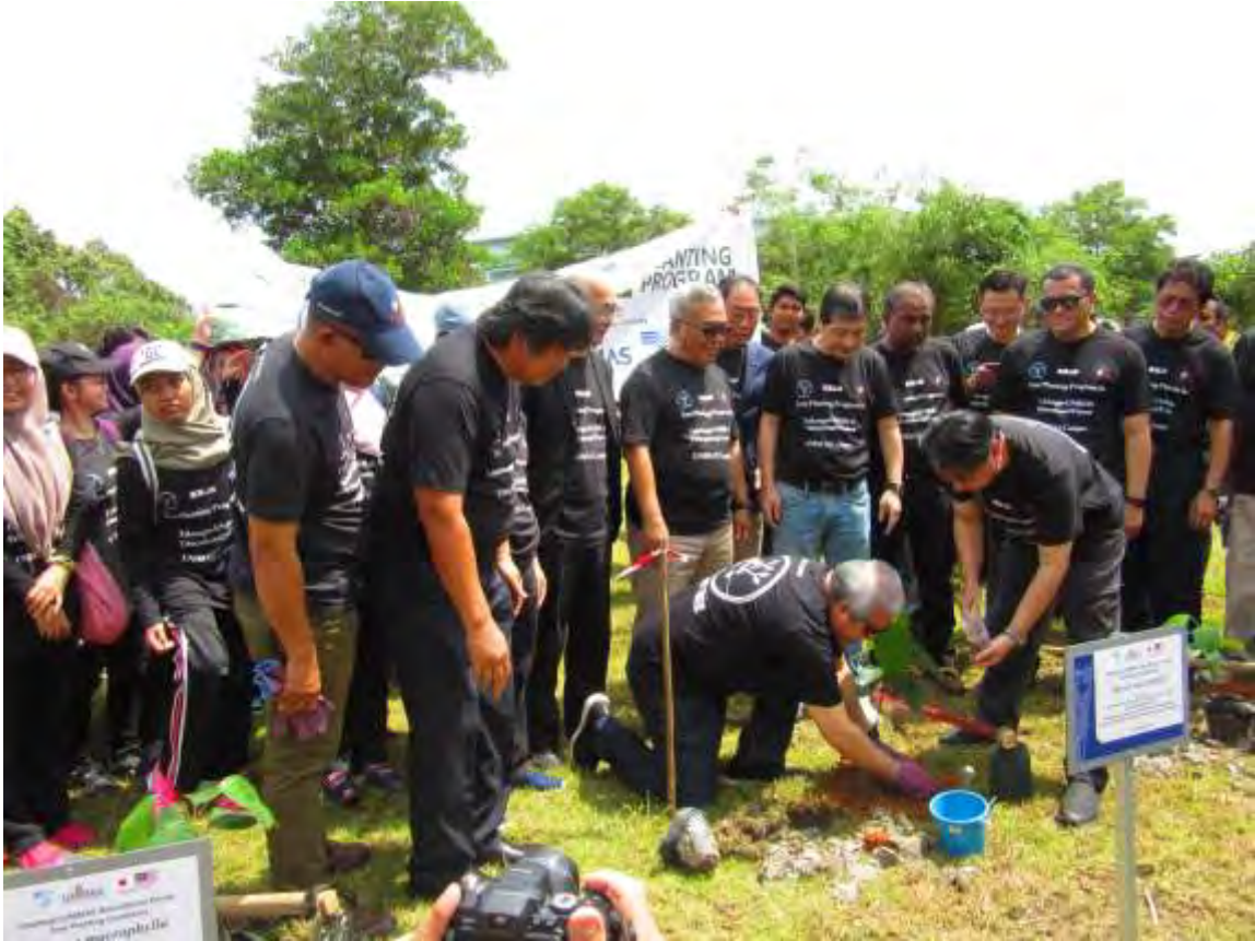
Tree Planting Ceremony at UNIMAS in October 2018