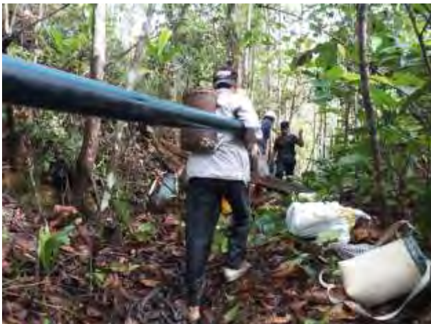
Pipe line laying