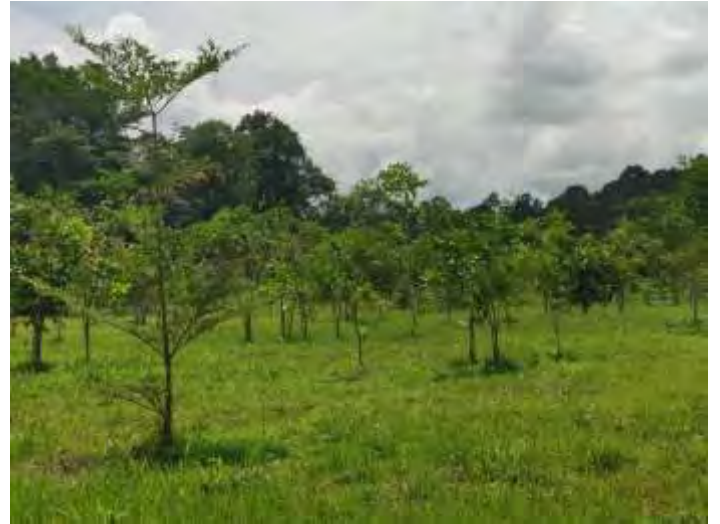
Tree planting program in 2019 (left) Planted trees growing well (right)