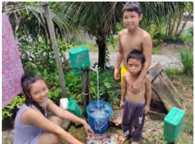
Clear water arrived at village houses