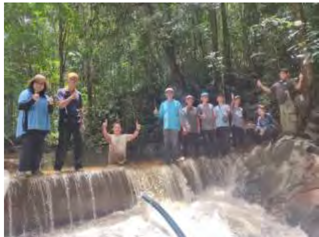
Small dam construction completed